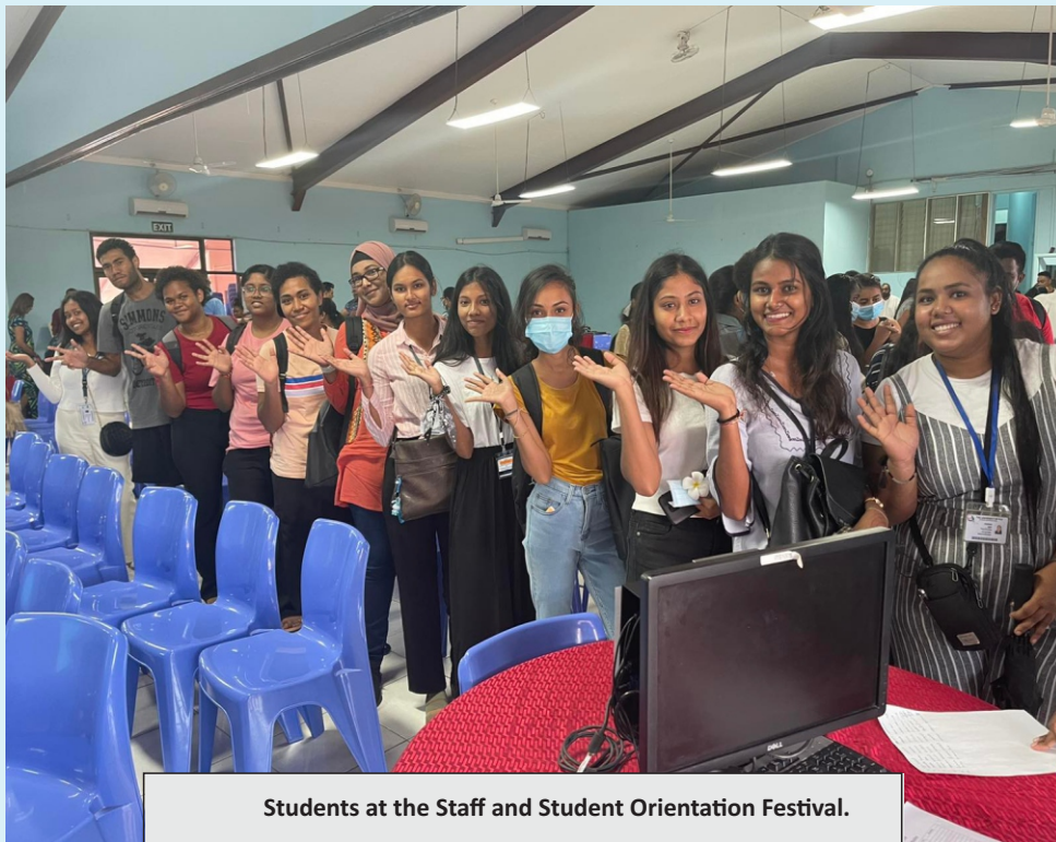
Students at the Staff and Student Orientation Festival.

The University of Fiji celebrated the first day of a week-long staff and student Orientation Festival on August 8, 2022.