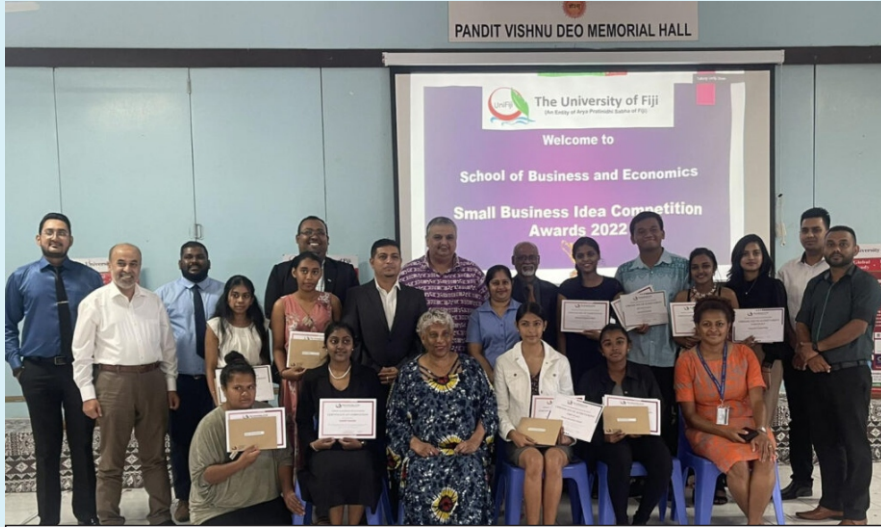
The University of Fiji Team and Participants

The University of Fiji's School of Business and Economics (SoBE) took the initiative to instigate young people to present their small business ideas through a Small Business Idea Competition.