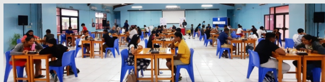
Participants during the final round of the tournament in the University's Main hall.