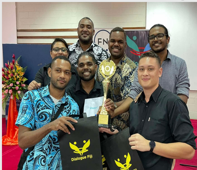
Debate team members after winning the first round of the debate competition.

The University of Fiji Debate Team won the first round of the Dialogue Fiji organised "Inter-University Debate on Elections" in April. The contest took place at the Fiji National University's Nasinu Campus.