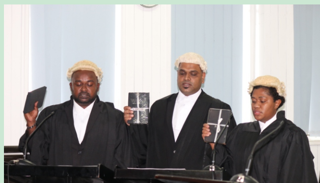
GDLP students taking the oath during their admission to the bar