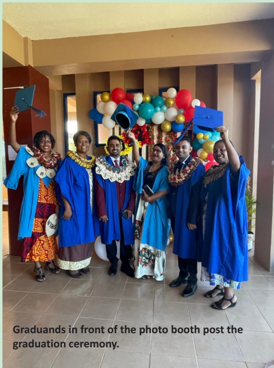
Graduands in front of the photo booth post the graduation ceremony.

"Our new Strategic Plan provides guidance for the generations to come - to make a real difference to the world they live in. Students who are preparing to study at The University of Fiji and those who are currently with us will be the actual beneficiaries of the new philosophical direction of the University. However, those who are graduating today will nevertheless take with them the culture of our University as they find jobs or go on to further study," she said.