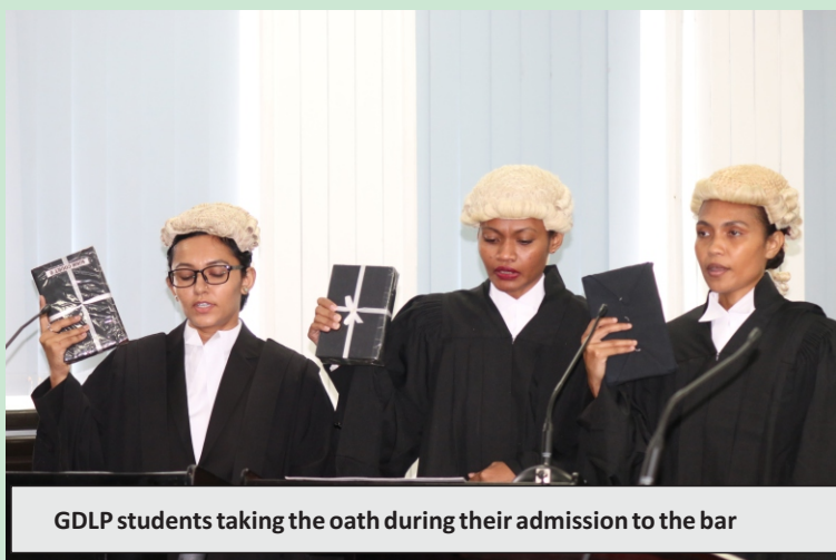
GDLP students taking the oath during their admission to the bar

“Covid-19 has made us realise the importance of excellent legal education which is a necessity now and not a luxury,” she said.