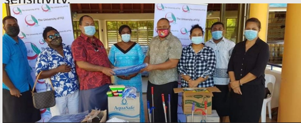
Students and staff donating the relief supplies to the Tongan Community in Suva.

The University decided that the best way to assist was to respond to the needs about which the Tongan people had themselves informed the Fijian Government and to facilitate their requests in a spirit of understanding and sensitivity.