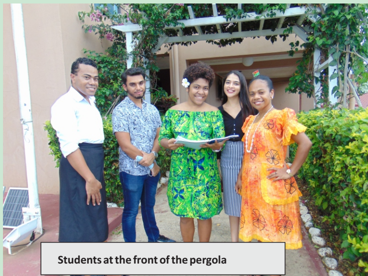
Students at the front of the pergola

The University of Fiji started offering four cutting edge new programmes from Semester 1, 2022. They are: Bachelor of Agricultural Engineering, Bachelor of Journalism and Media Studies, Diploma in Counselling and PhD in Business Administration (DBA).