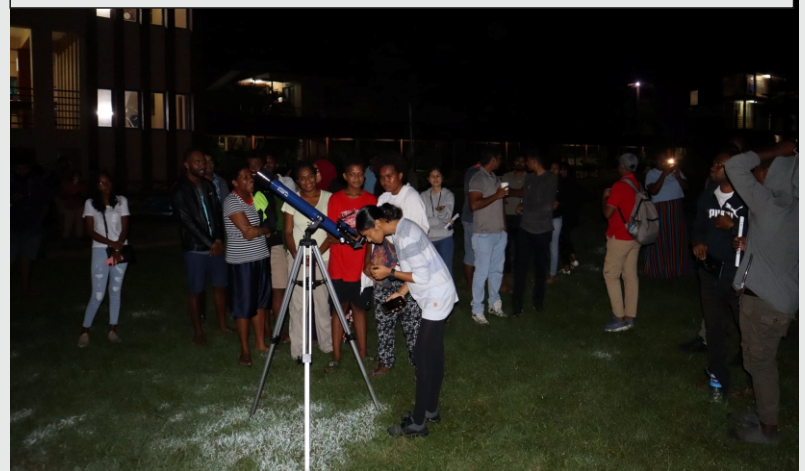
Students at the star gazing event in the early hours pre Easter weekend. The event was attended by several students and staff.

Young people and adults alike are invited to join SPASE where events and telescopic viewings of the night skies will regularly be held. Planetary scientists and astronomers will be invited to deliver lectures throughout the year at the Saweni Campus of the University.