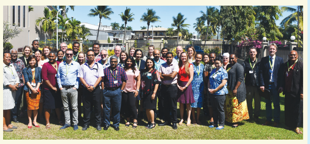
Attendees at the 2nd Symposium on Climate Change Adaptation at Tanoa Waterfront Hotel.