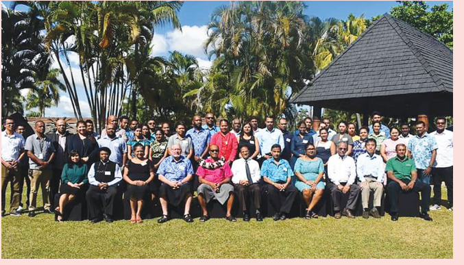
UniFiji staff, students and distinguished guests at the International Conference change. on Renewable Energy.