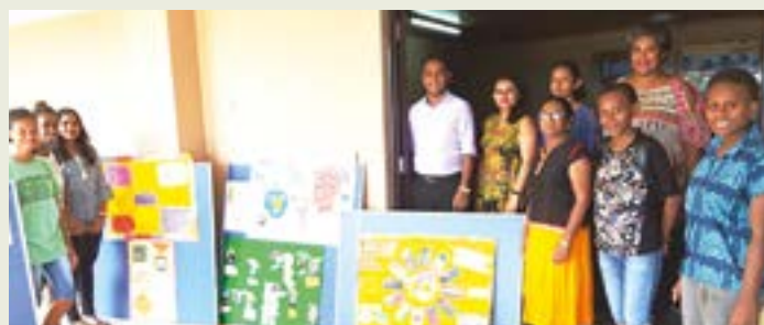
LLC Staff and Students with their displays in the foyer.