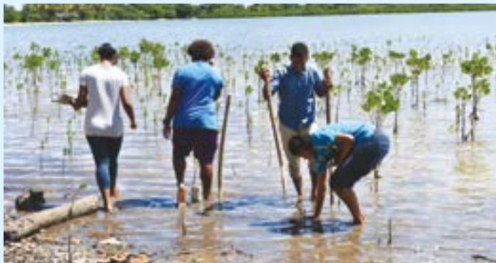
Students planting mangroves at Saweni Beach.

The University of Fiji's School of Science and Technology (SoST) students in collaboration with the Ministry of Forestry planted 1000 mangrove seeds at Saweni Beach on Monday, March 11, 2019. This was done to commemorate "World Earth Day" and help the Ministry achieve its goal to plant 4 million trees in 4 years.