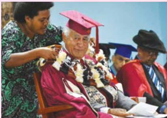
The Chancellor, Ratu Epeli Nailatikau garlanded during the graduation ceremony.

"This graduation will witness more than 200 students graduating in various programmes. The enormous contribution of the families to be the success of their children is applauded. This is an investment not only for the family but also for the nation.